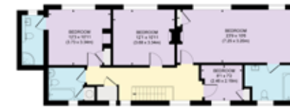
FIRST FLOOR DWELLING 2 - 'OLD ORCHARD' SELF CONTAINED RESIDENTIAL UNIT