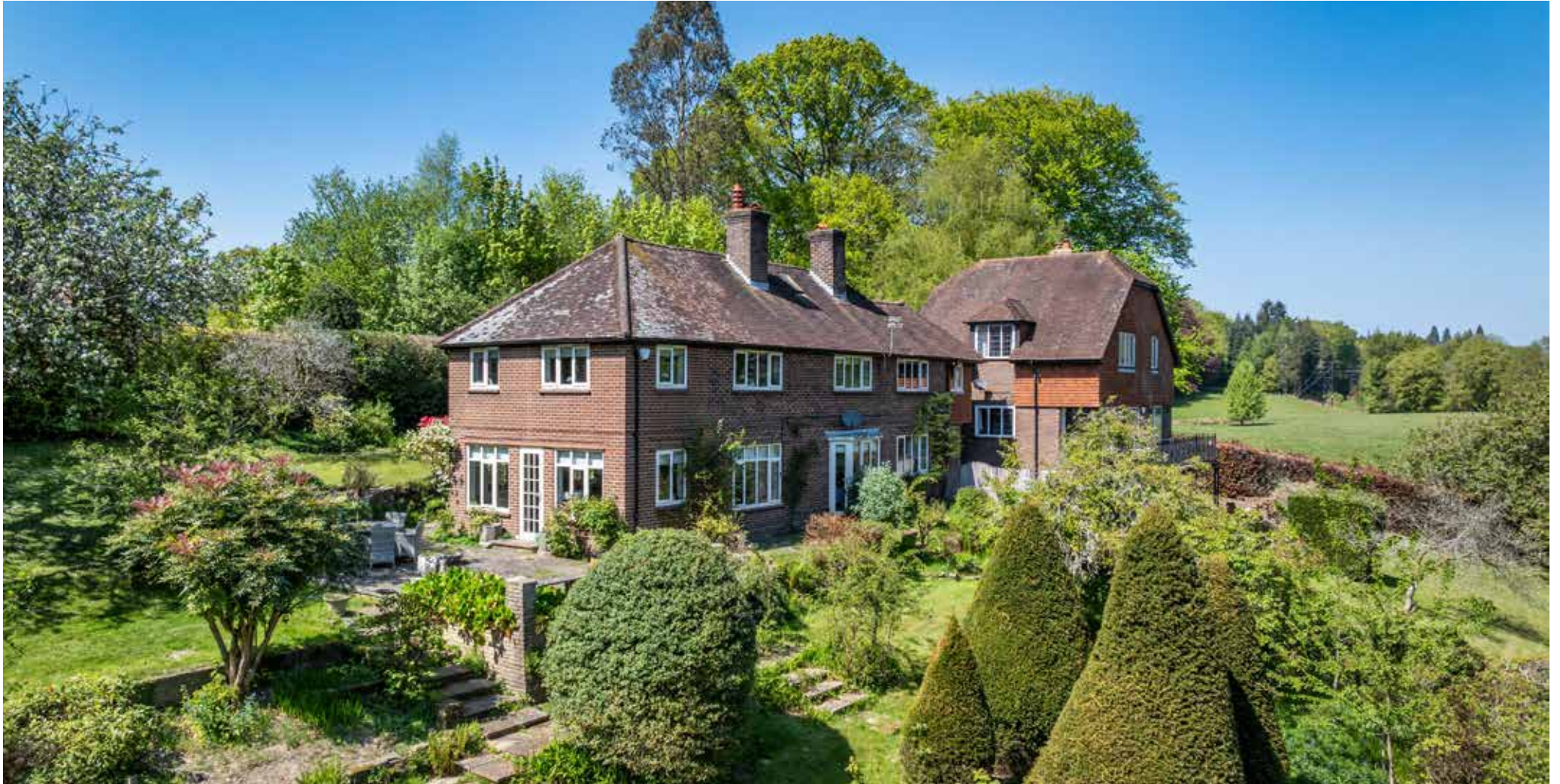
THE OLD ORCHARD, MARLEY HEIGHTS, HASLEMERE