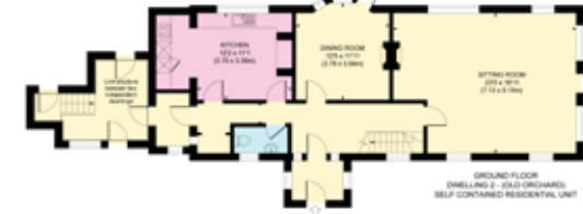
GROUND FLOOR DWELLING 2 - 'OLD ORCHARD' SELF CONTAINED RESIDENTIAL UNIT