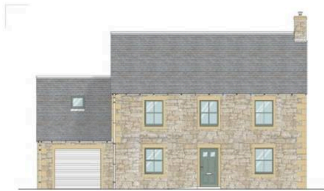
South East Elevation Scale 1:50