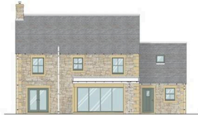
North West Elevation Scale 1:50