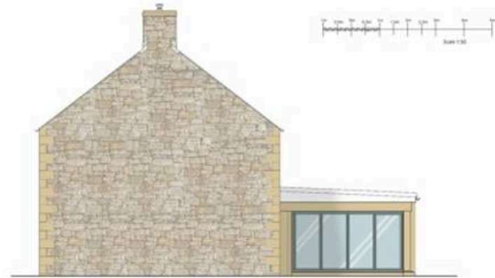
South West Elevation Scale 1:50