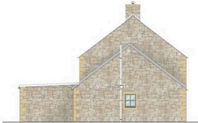
North East Elevation Scale 1:50