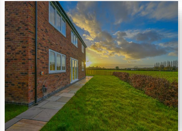
Plot 10 The Hawthorns, Scropton Derby DE65 5PP