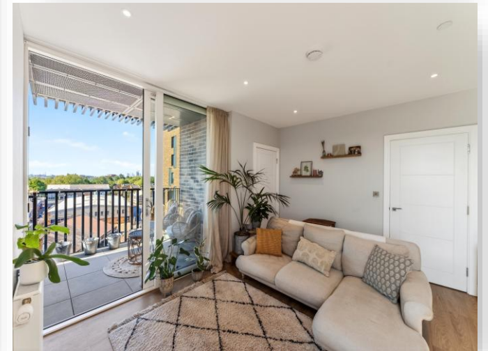
Millwards Court, Greyhound Parade, London SW17 0JQ