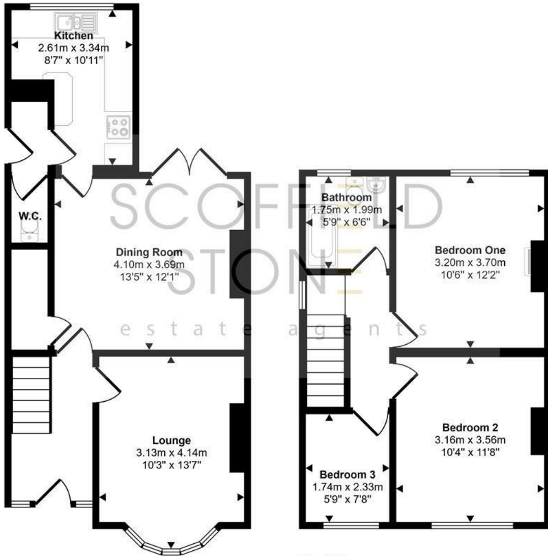
Ground Floor Approx 47 sq m / 503 sq ft

Approx Gross Internal Area 85 sq m / 910 sq ft