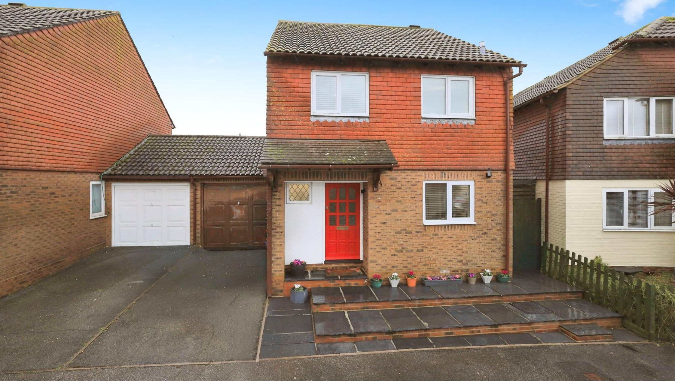
Hawkstown View, Hailsham BN27 1HH