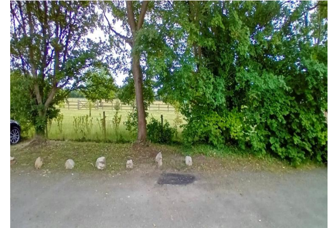
Lansdowne Road, Dry Sandford, Abingdon, OX13 6EA