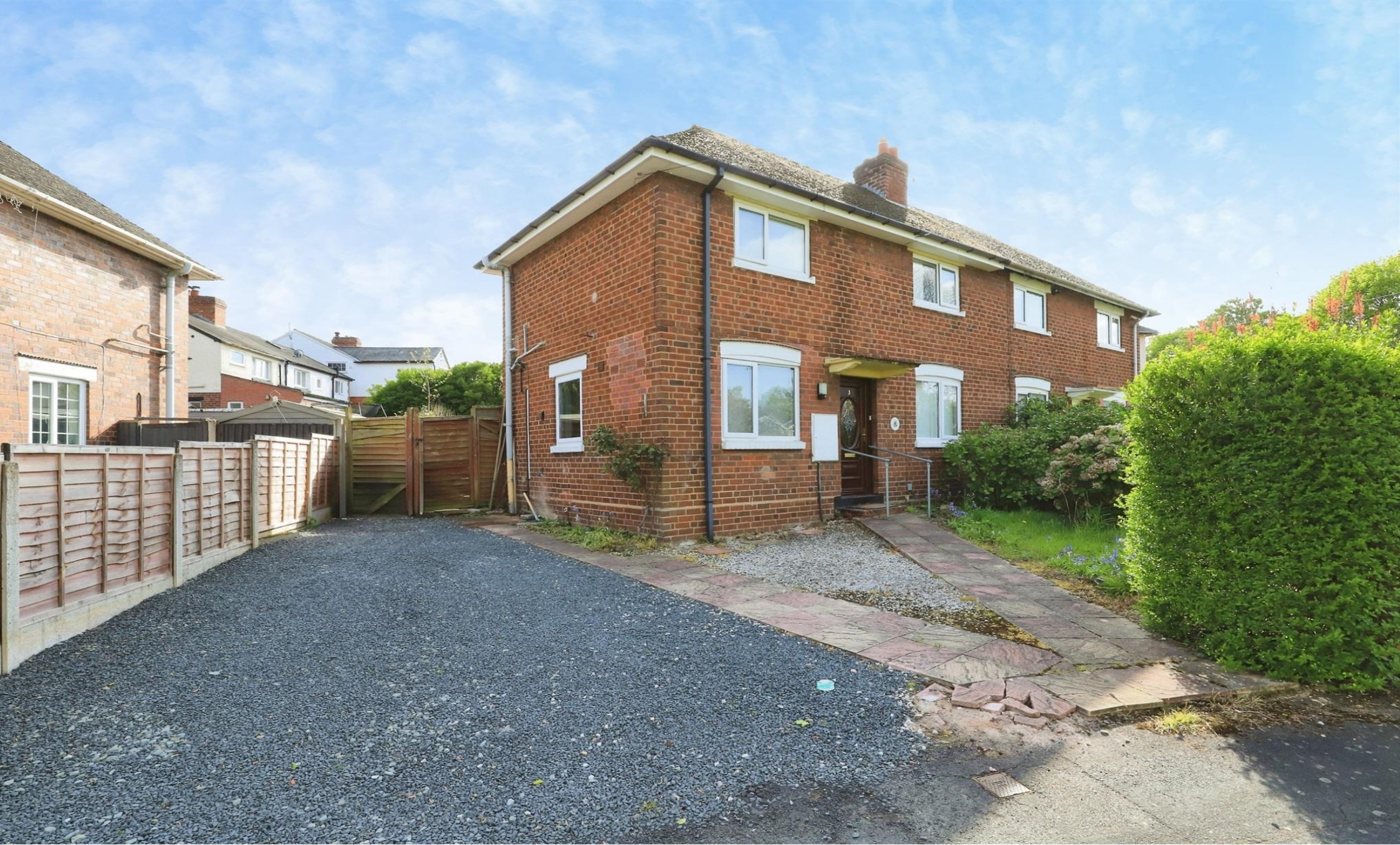
The Serpentine, Kidderminster DY11 6NX