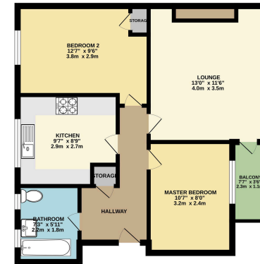
TWO BEDROOM APARTMENT TOTAL FLOOR AREA: 530 sq.ft. (49.2 sq.m.) approx. *These energy efficiency ratings are based on the standard of the building and the energy efficiency of the building. The energy efficiency of the building is determined by the energy efficiency of the building and the energy efficiency of the building. The energy efficiency of the building is determined by the energy efficiency of the building and the energy efficiency of the building.

Guide Price £225,000 - £250,000. Investors and First Time Buyers, this is for you. Affordable ground rent, impressive lease remaining, double bedrooms, separate kitchen, and ideal location.