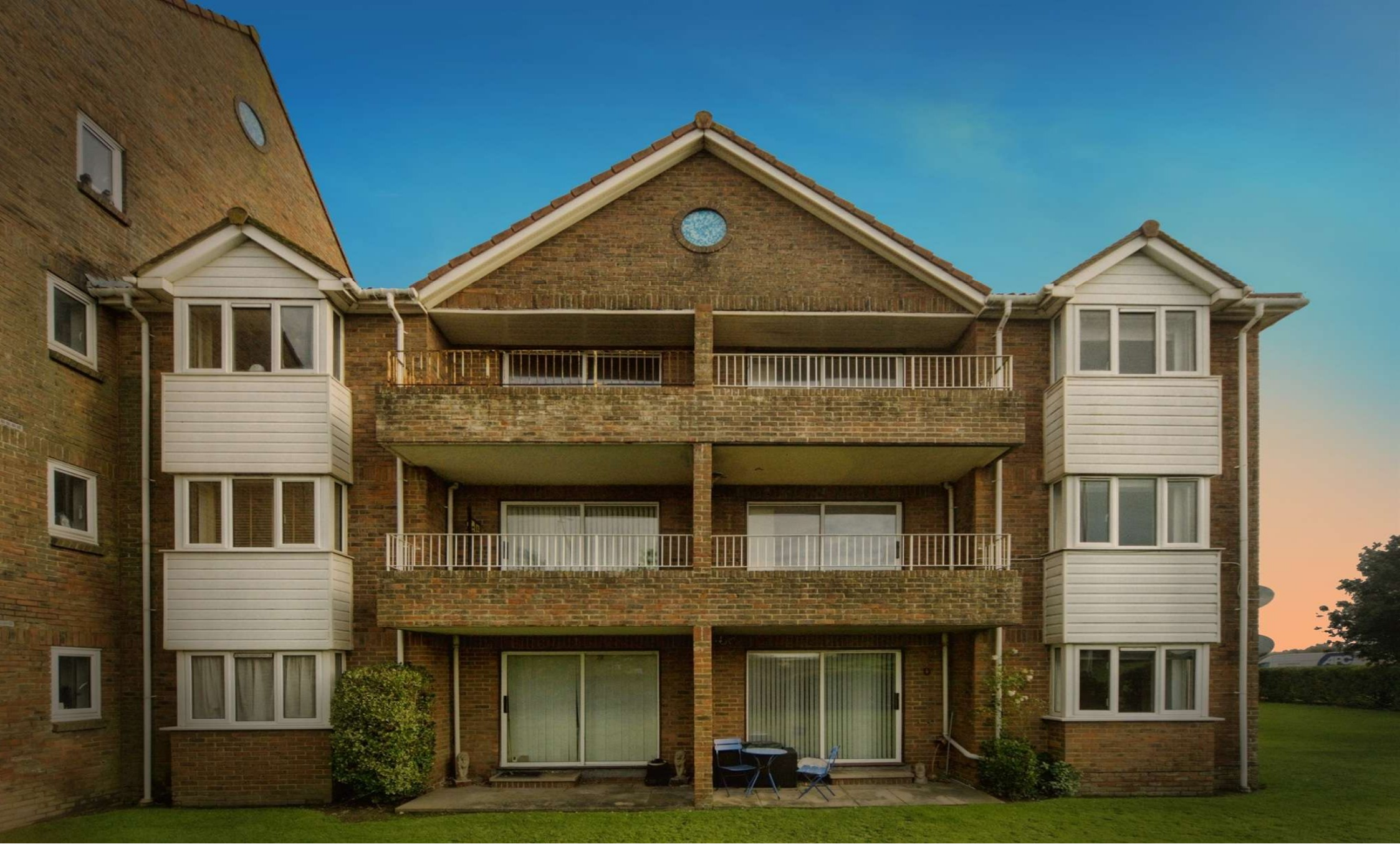
Collingwood Close, Eastbourne BN23 6HZ