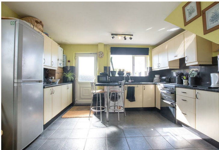
Tenure: Freehold Council Tax Band: A

Viewing strictly by appointment with Hawksbys on 01933 724444