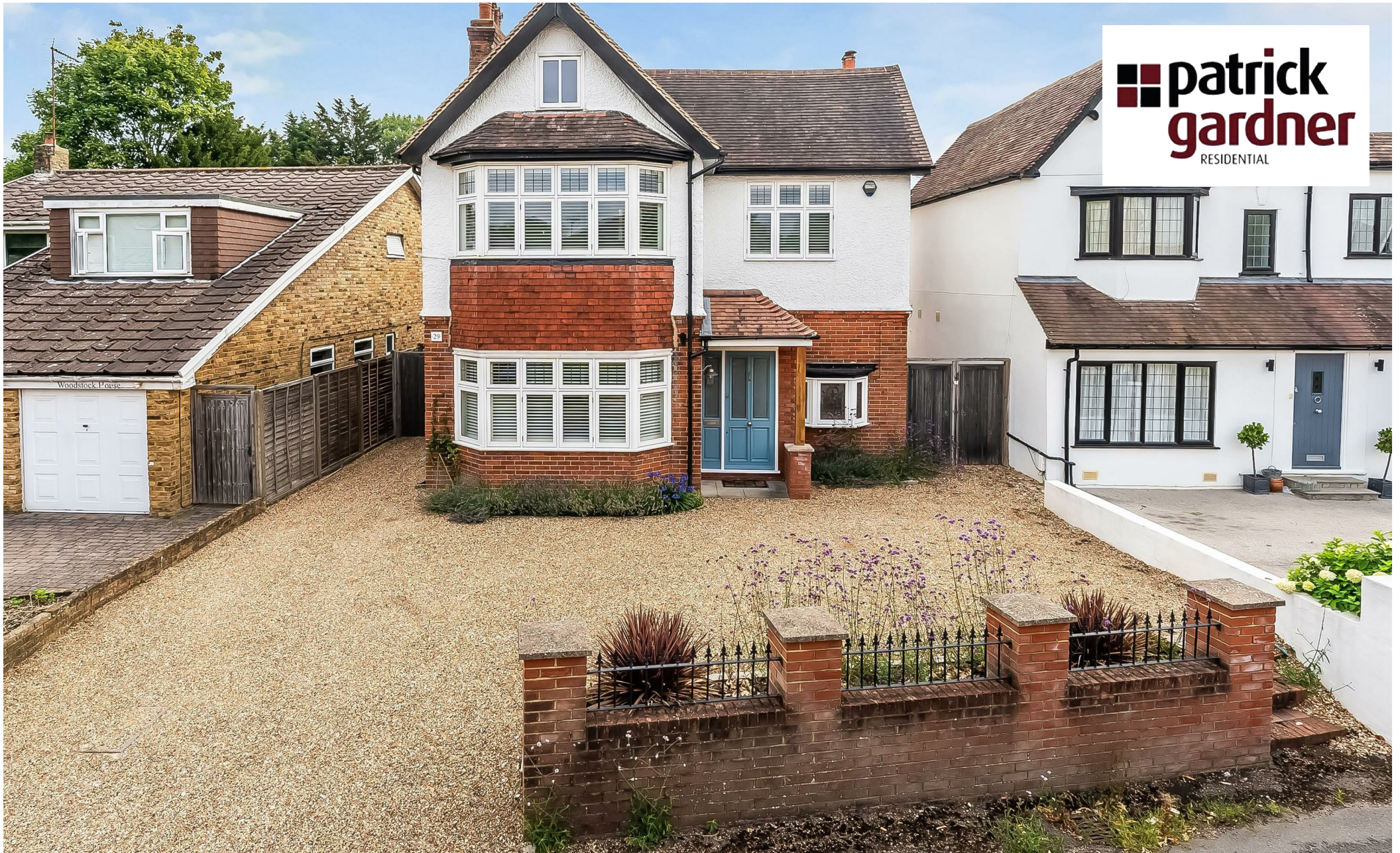
29 Agates Lane, Ashted, Surrey, KT21 2ND