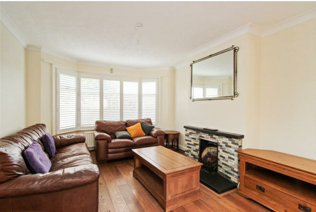
Lounge 42'7" x 37'8" (13 x 11.5)

Located in a most desirable road in Whitstable, with access to nearby schools and amenities plus comfortable access to the town, station and seafront! Offering spacious family accommodation with up to 5 bedrooms, 2 reception rooms, open plan kitchen/breakfast, utility room, ground floor shower room and first floor bathroom. There is a generous rear garden plus off street parking to the front, available now, interested applicants should be earning in excess of £67.500.