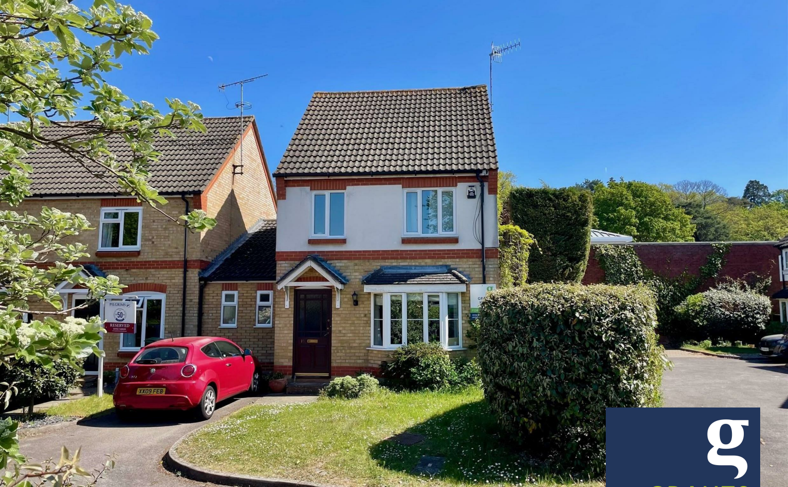
Fernihough Close, Weybridge, KT13 0UY