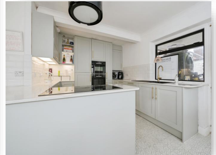
Gainsford Road, Southampton SO19 7AS