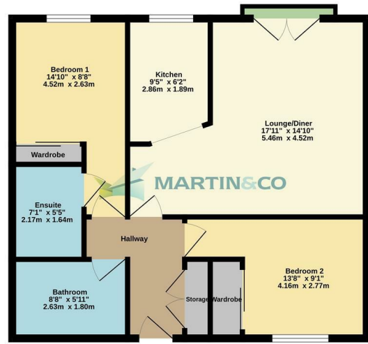
TOTAL FLOOR AREA: 635 sq.ft. (59.0 sq.m.) approx. Made with Metrepro (2025)