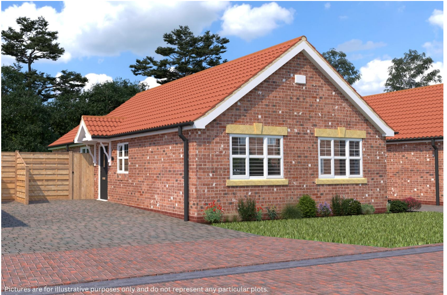
Pictures are for illustrative purposes only and do not represent any particular plots.