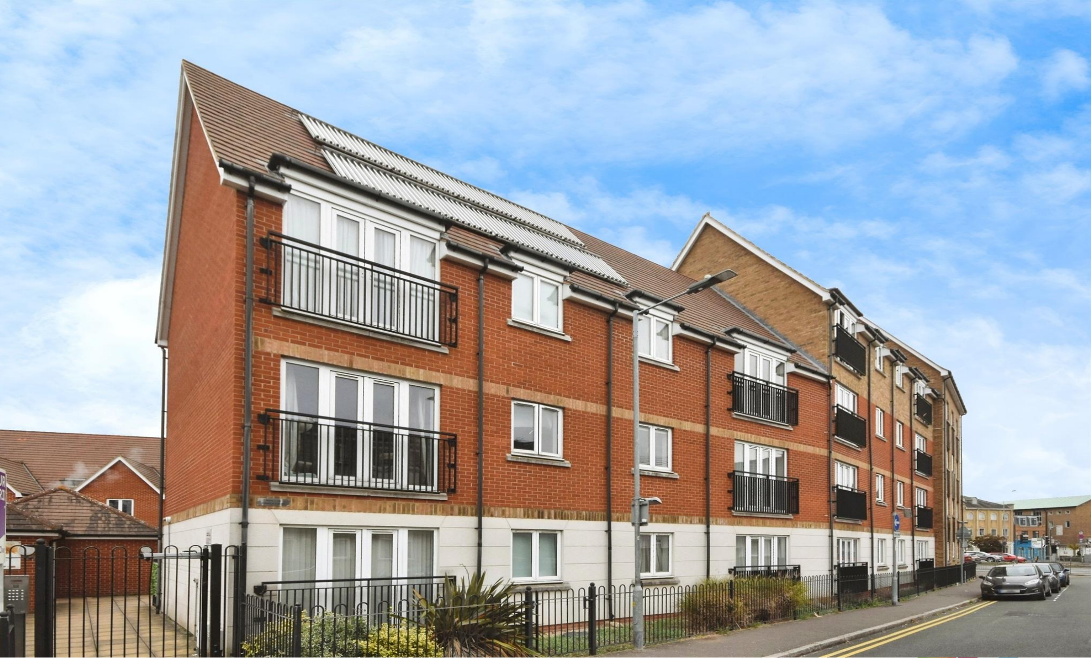
Primula Court Primrose Hill, Chelmsford CM1 2FZ