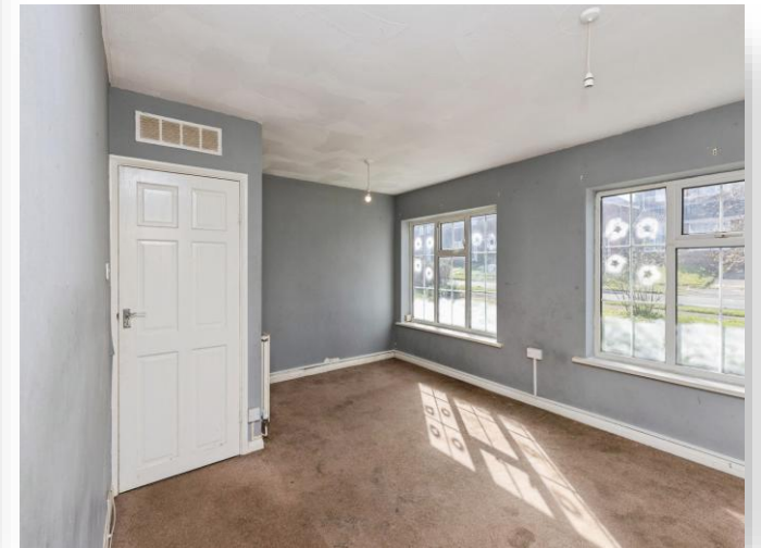
Dalecroft Rise, Allerton Bradford BD15 9AX