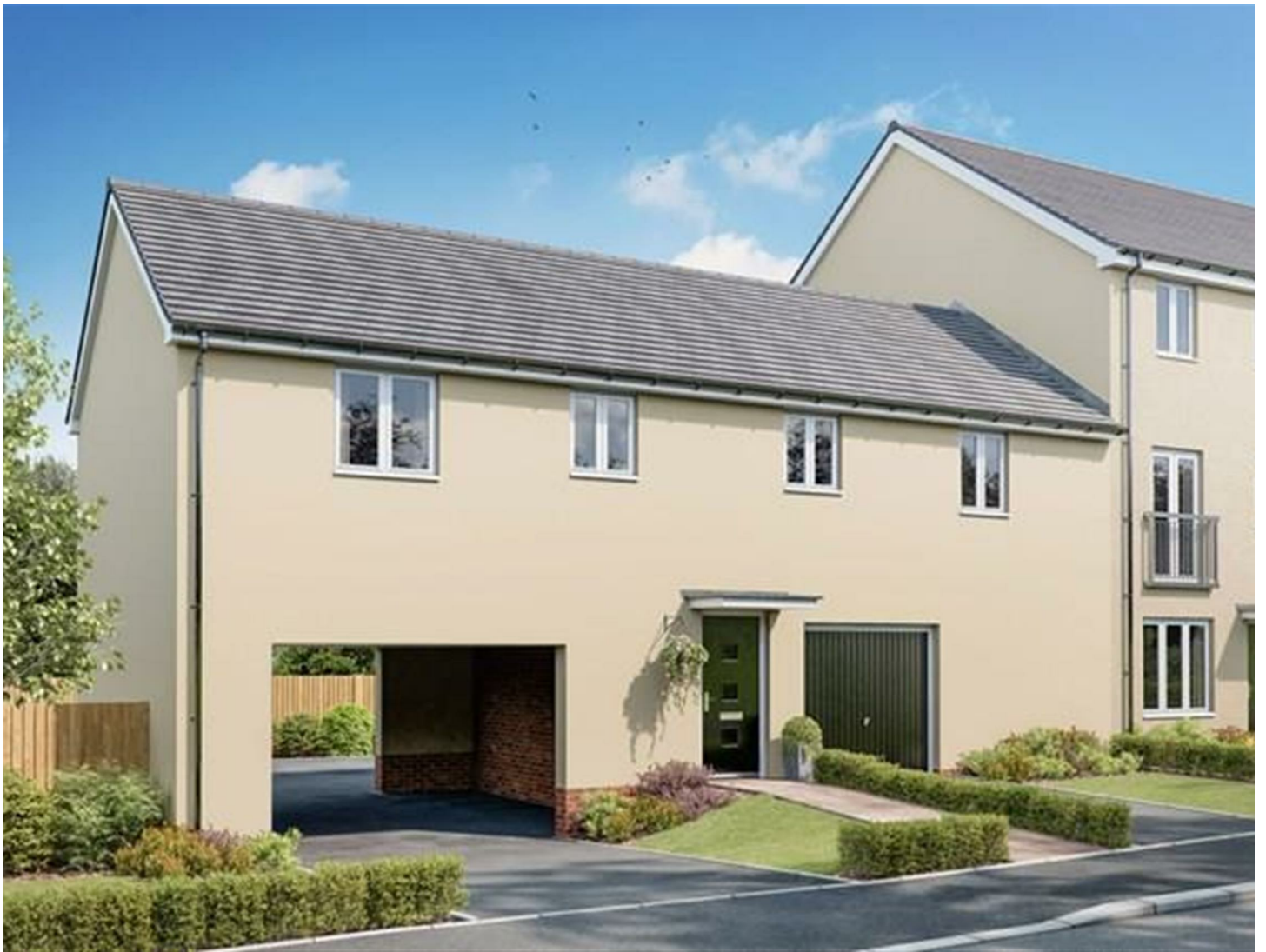
The Redhill, plot 142