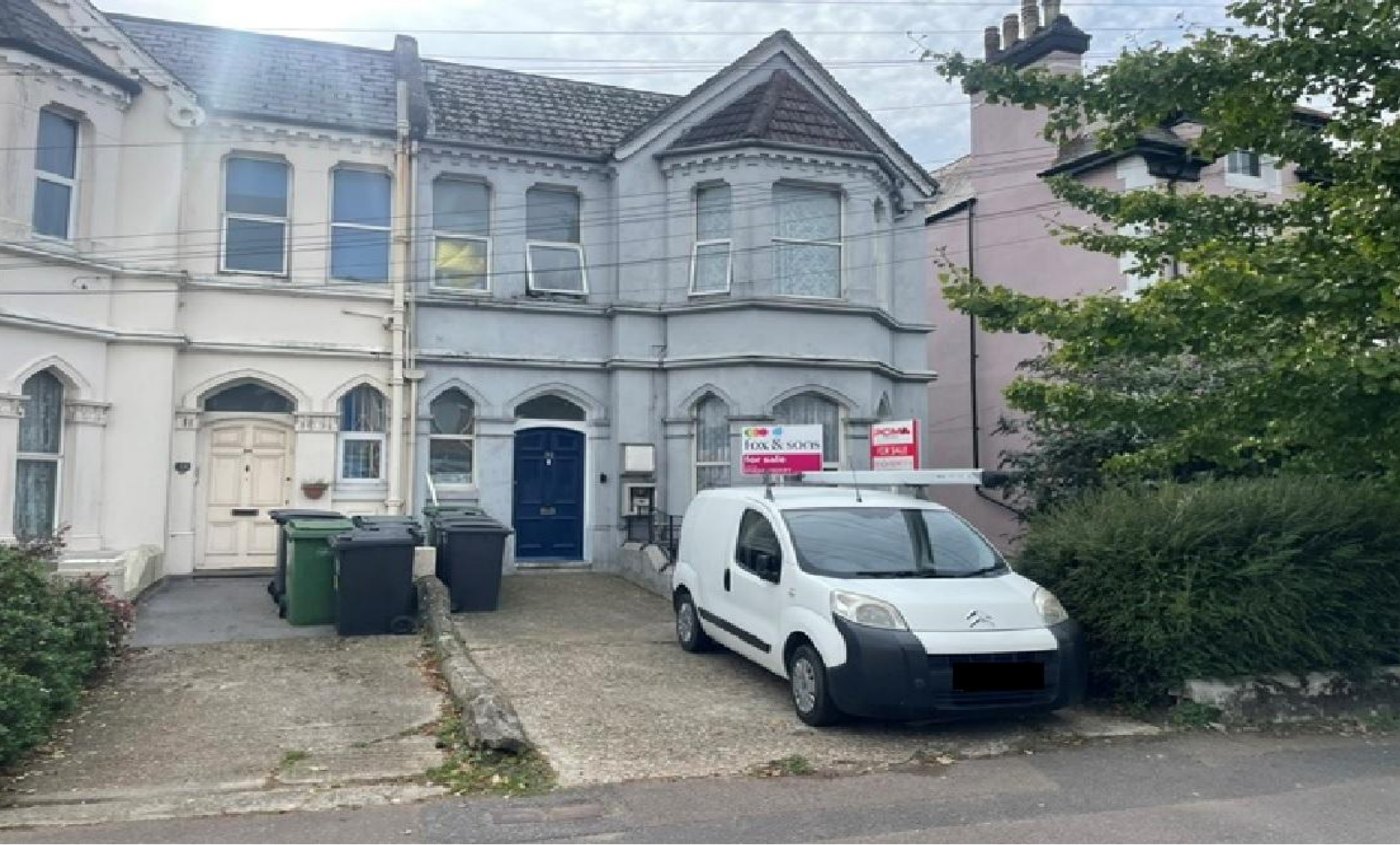
Mount Pleasant Road, Hastings TN34 3SH