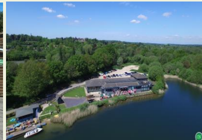
Kingfisher on the Quay

Cognatum Property Limited, Pipe House, Lupton Road, Wallingford, Oxfordshire OX10 9BS