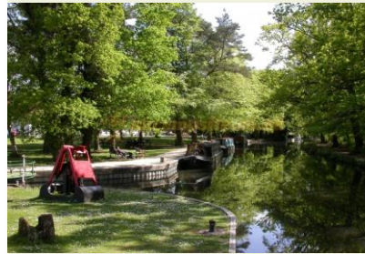
The Basingstoke Canal