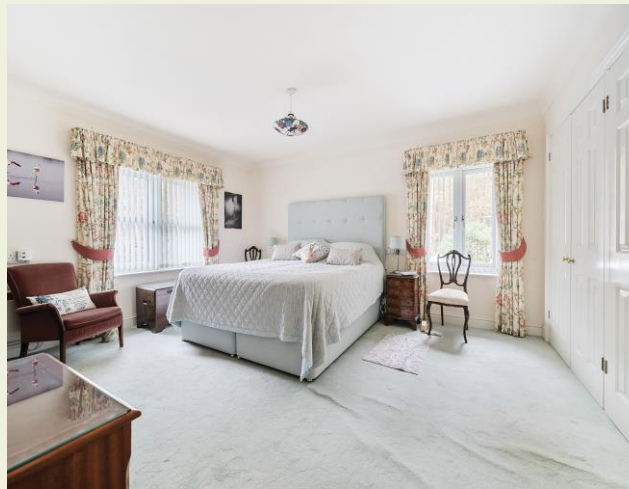
Bedroom 1 of 2