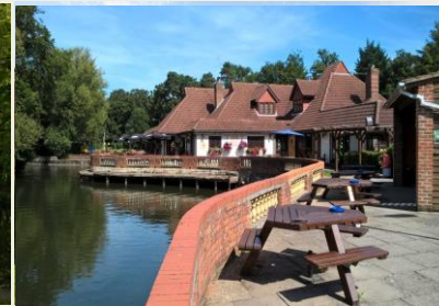
The Potters Bar