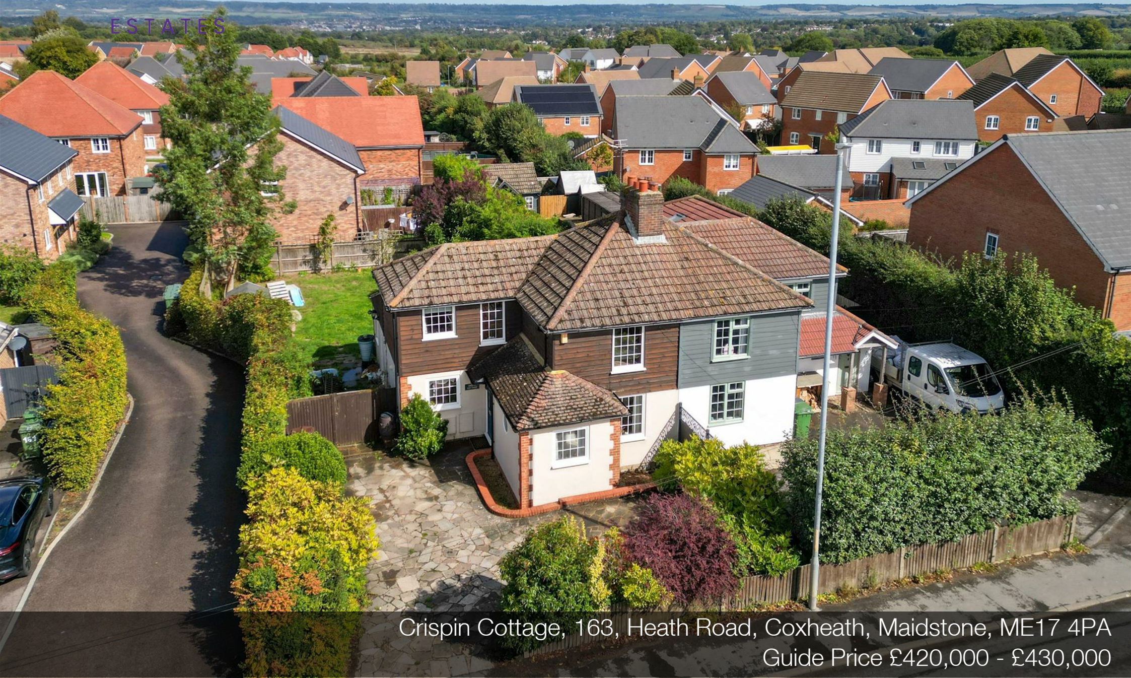
Crispin Cottage, 163, Heath Road, Coxheath, Maidstone, ME17 4PA Guide Price £420,000 - £430,000