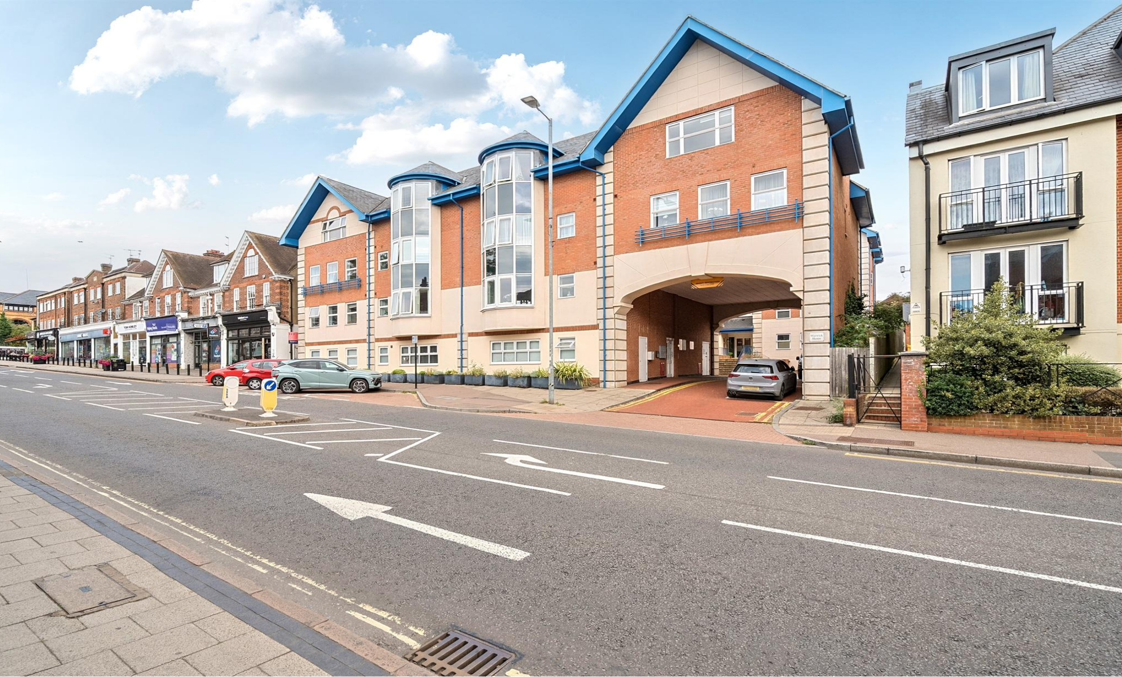
Warwick House, London Road, St. Albans, AL1 1PX