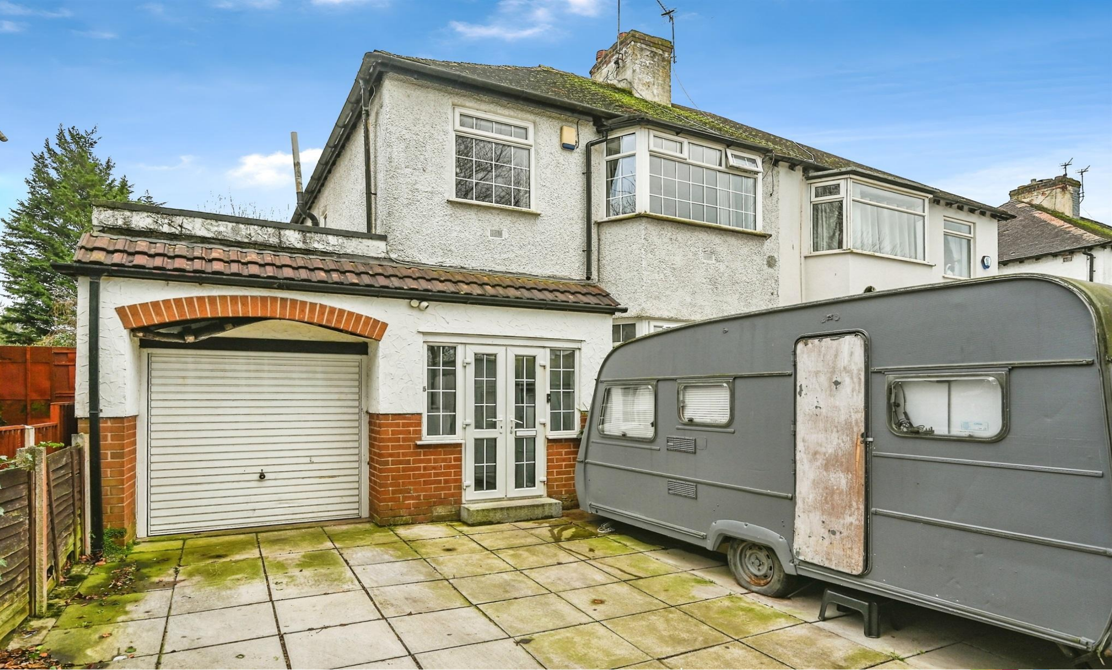
Olive Grove, Wavertree Liverpool L15 8LU