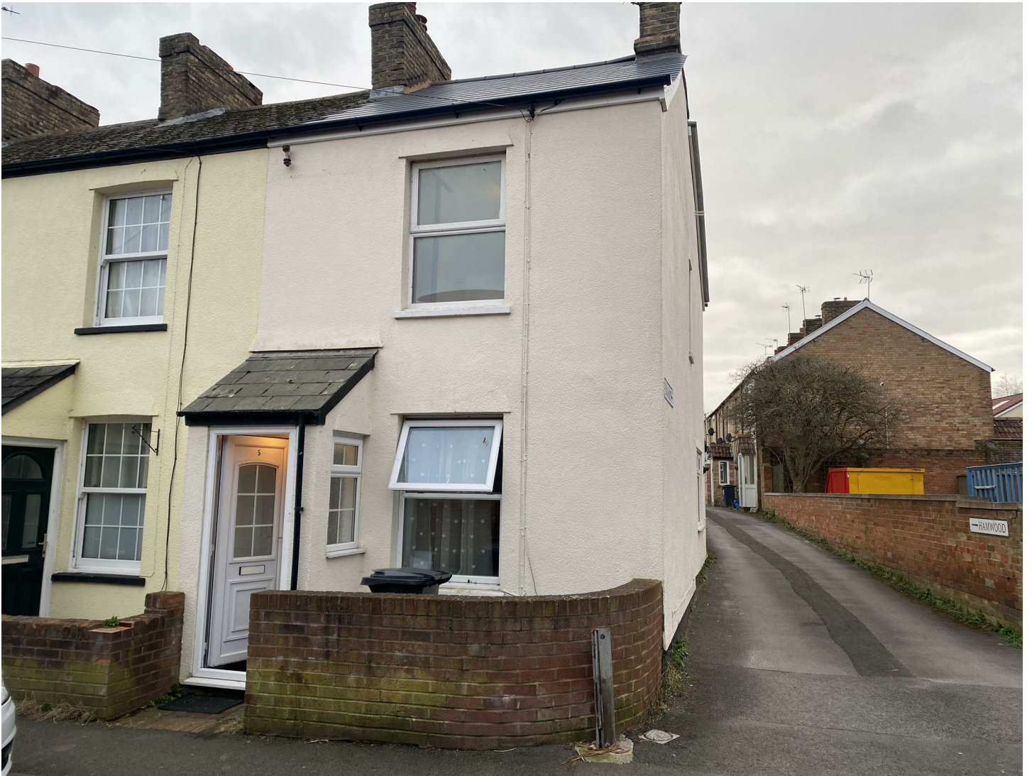
5 Hamwood Terrace