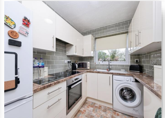
Ruskin Court, Newport Pagnell, MK16 0JL