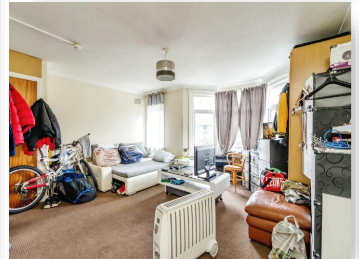
Whyke House Gordon Avenue, Bognor Regis PO22 9LG