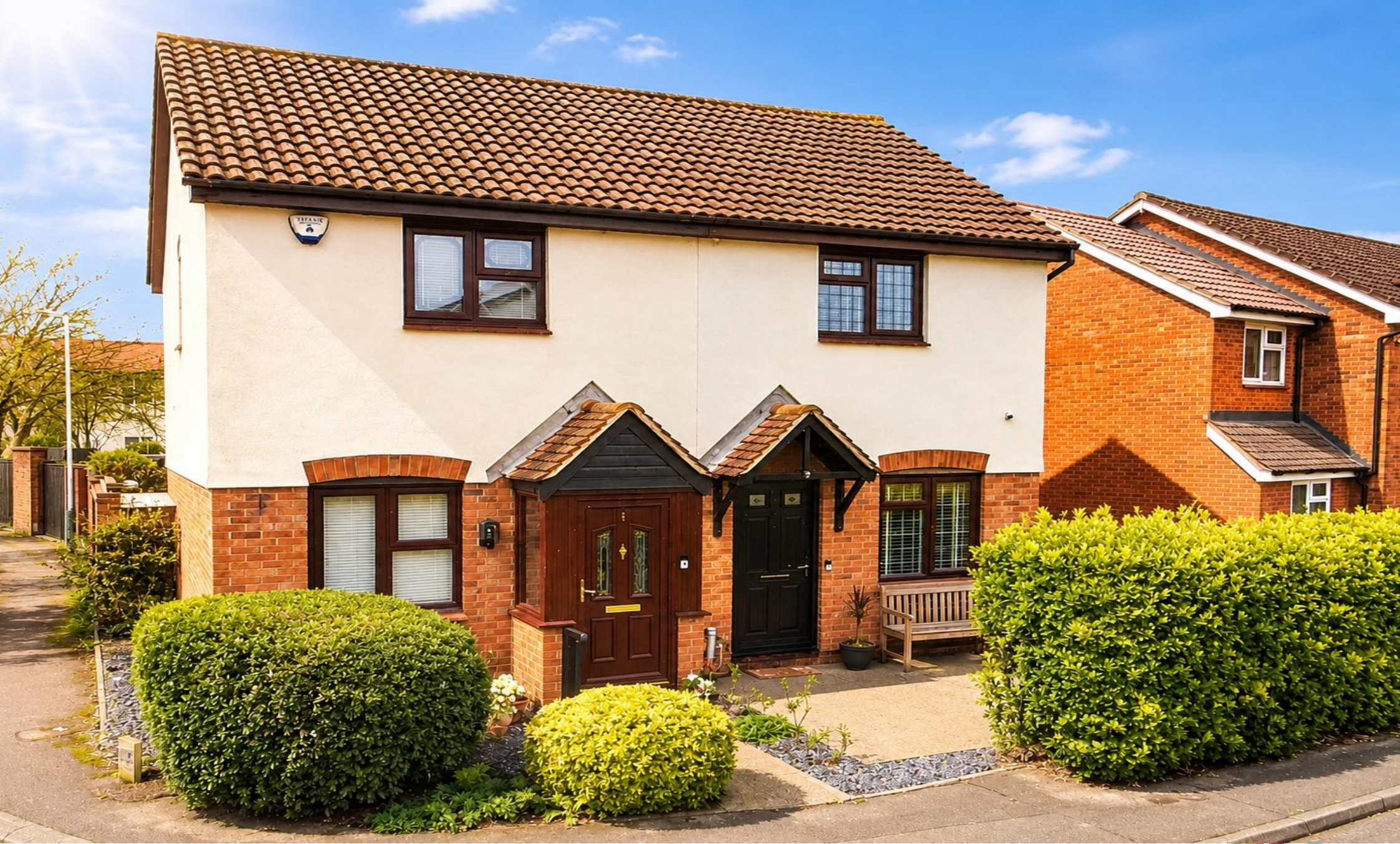
Mansard Close, Hornchurch, RM12 4HS