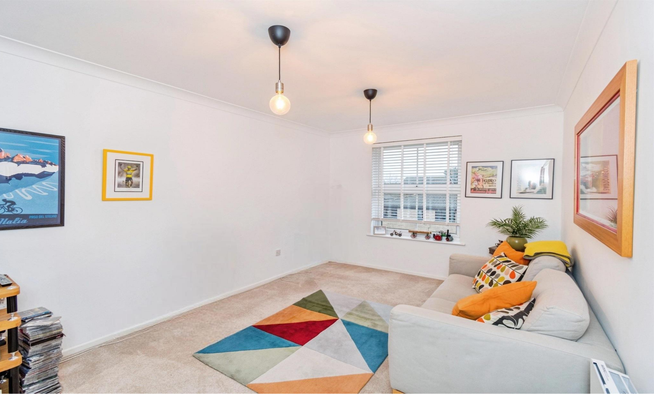
Clifton Lodge, Clifton Road, SOUTHAMPTON SO15 4GX