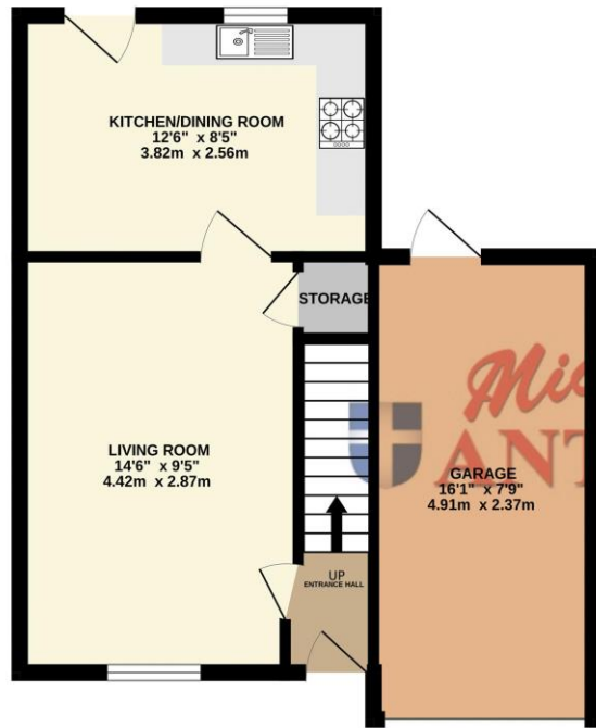
GROUND FLOOR 412 sq.ft. (38.3 sq.m.) approx.