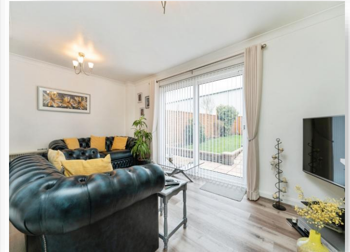
Ash Tree Close, Wimblington PE15 0RJ