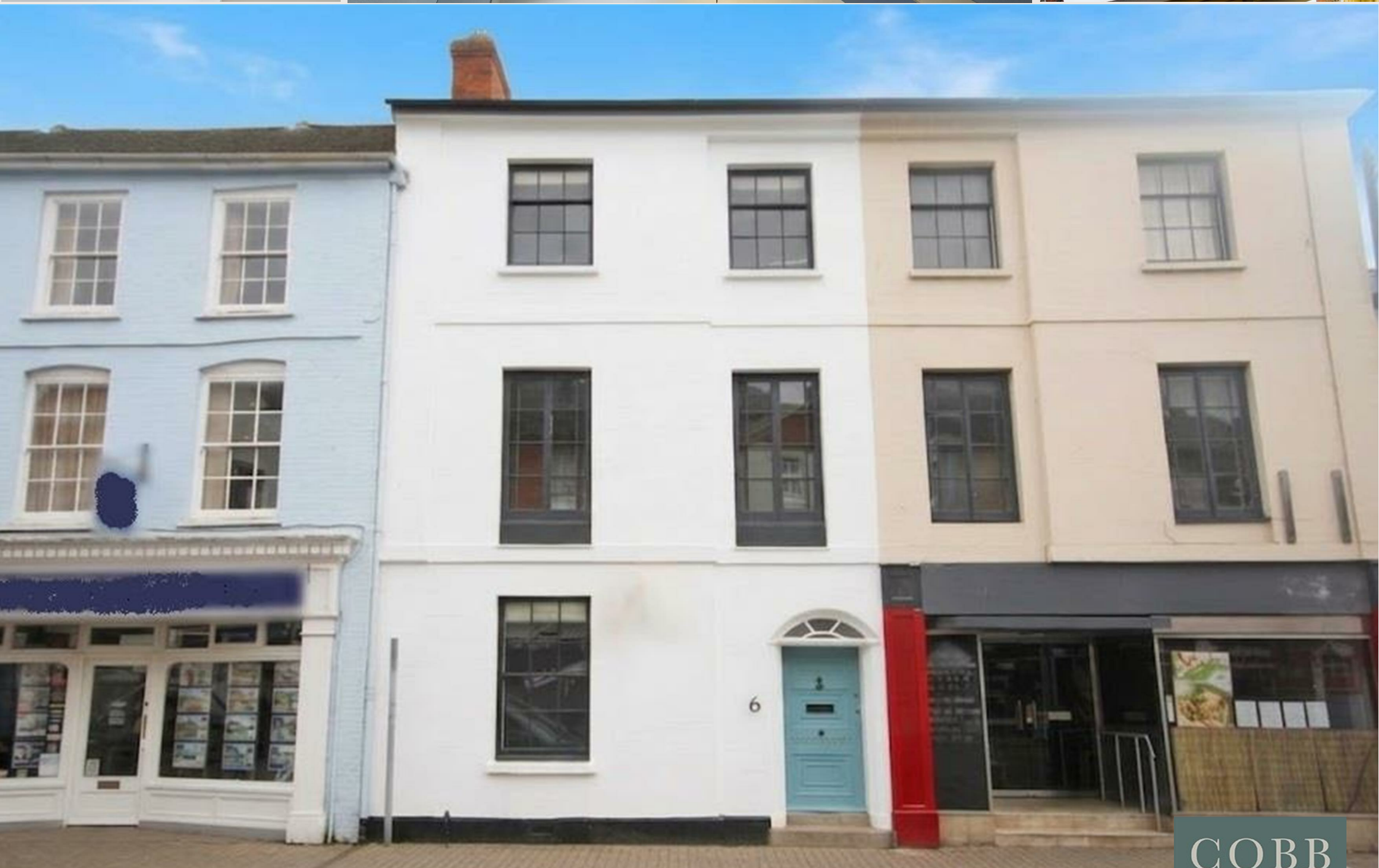
The Townhouse, 6, Bridge Street, Hereford, HR4 9DF Price £285,000