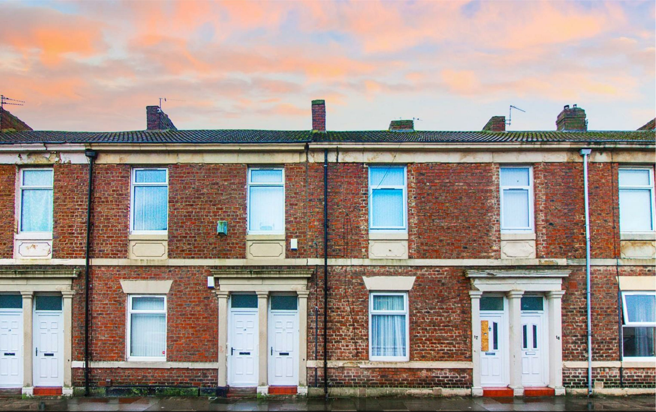
📍 Grey Street, North Shields NE30 2DZ