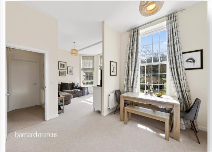
Drummond Court, Dillon Close, Epsom KT19 8GZ