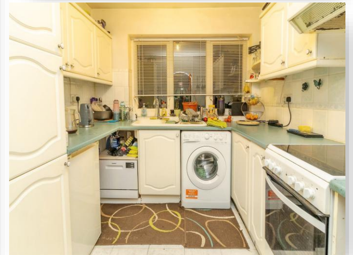
Rowle Close, Stantonbury, Milton Keynes, MK14 6BJ