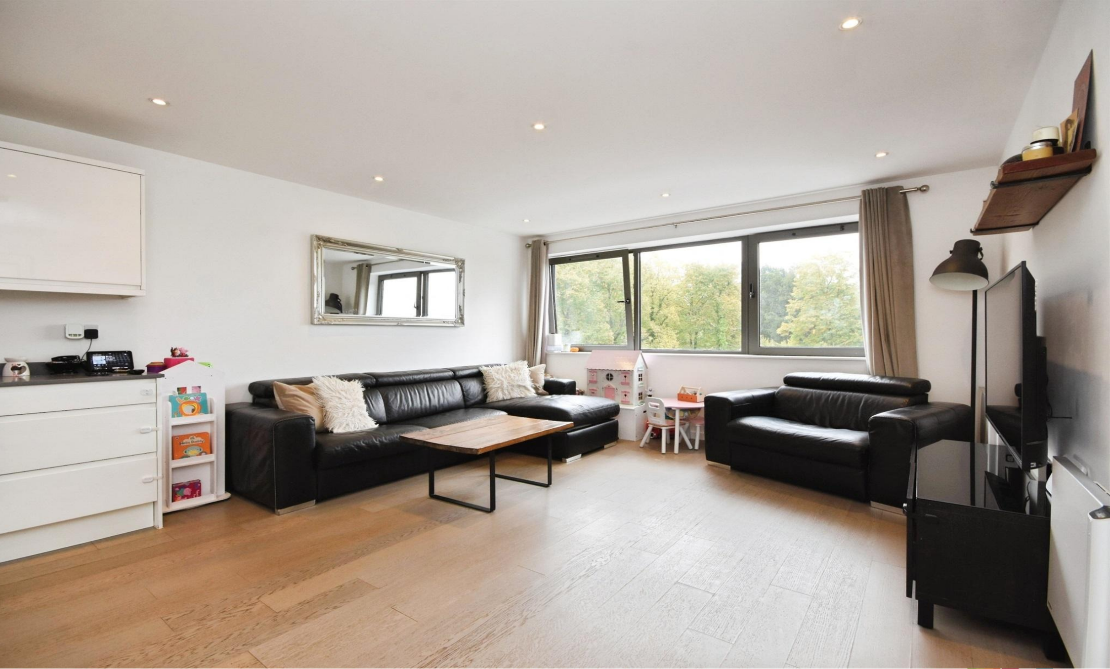
Regent House, Hubert Road, Brentwood, CM14 4WL