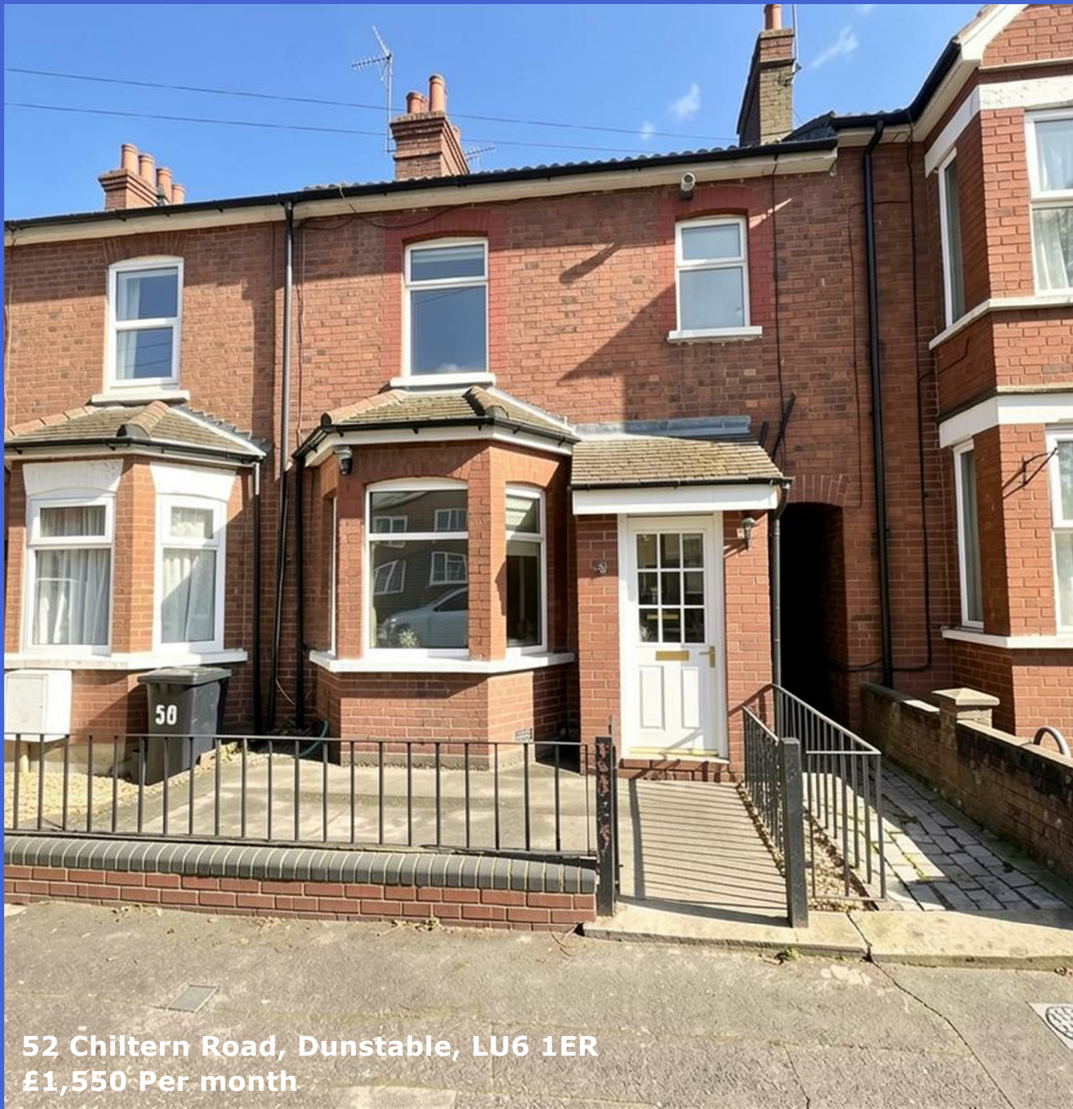
52 Chiltern Road, Dunstable, LU6 1ER £1,550 Per month