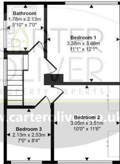
First Floor Approx 39 sq m / 421 sq ft