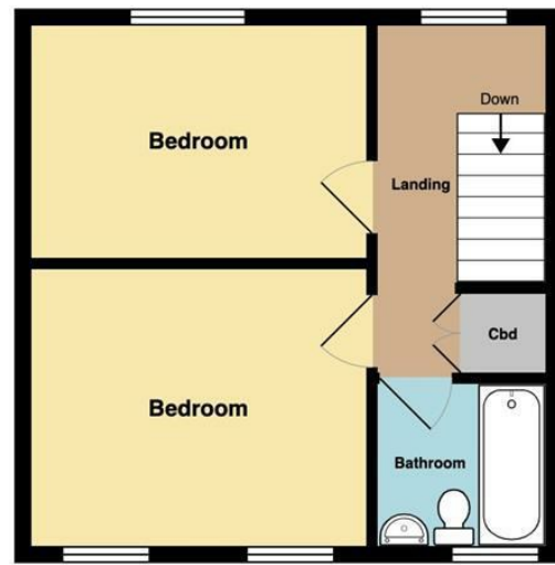
1st Floor Area (approx): 29.8 m 2 ... 320 ft 2