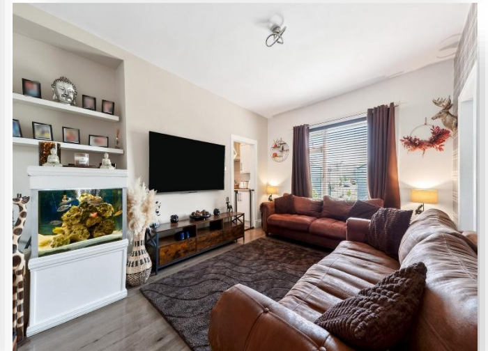
Crofton Avenue, Glasgow G44 5HZ