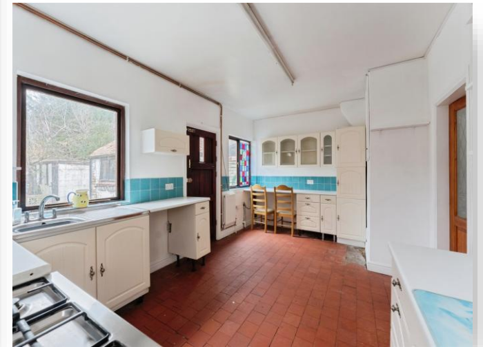
Station Road, Little Sutton Ellesmere Port CH66 1NU