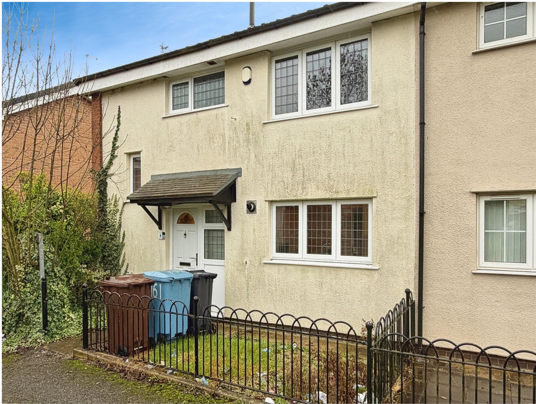
Haydock Garth, Bransholme, Hull, HU7 4LW