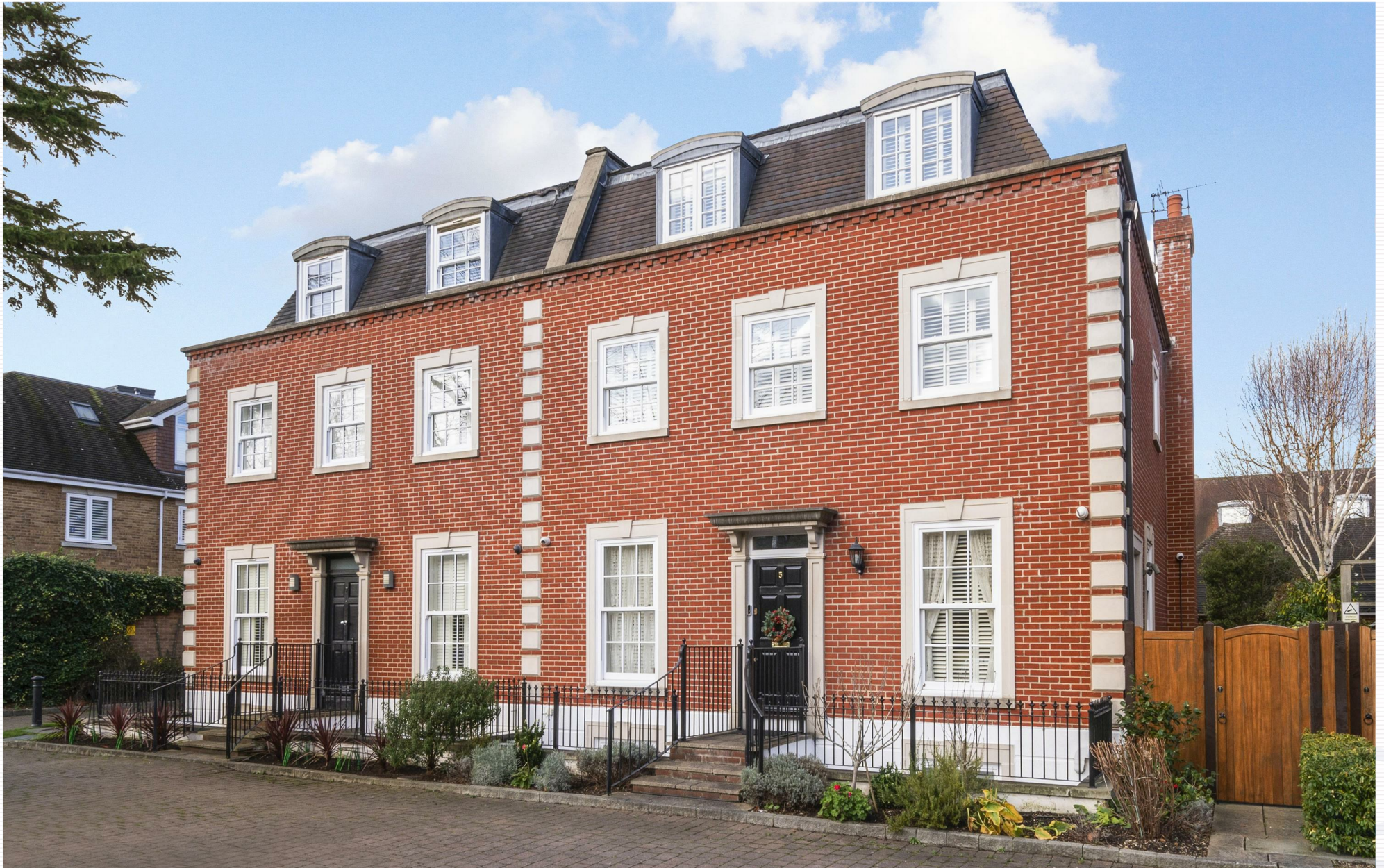
Rydon Mews, Wimbledon, SW19 4RP