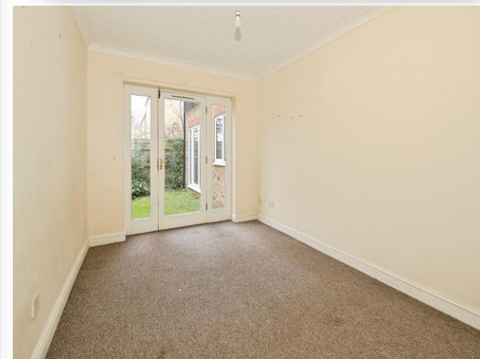
Sovereign Place, Peterborough PE3 6DS