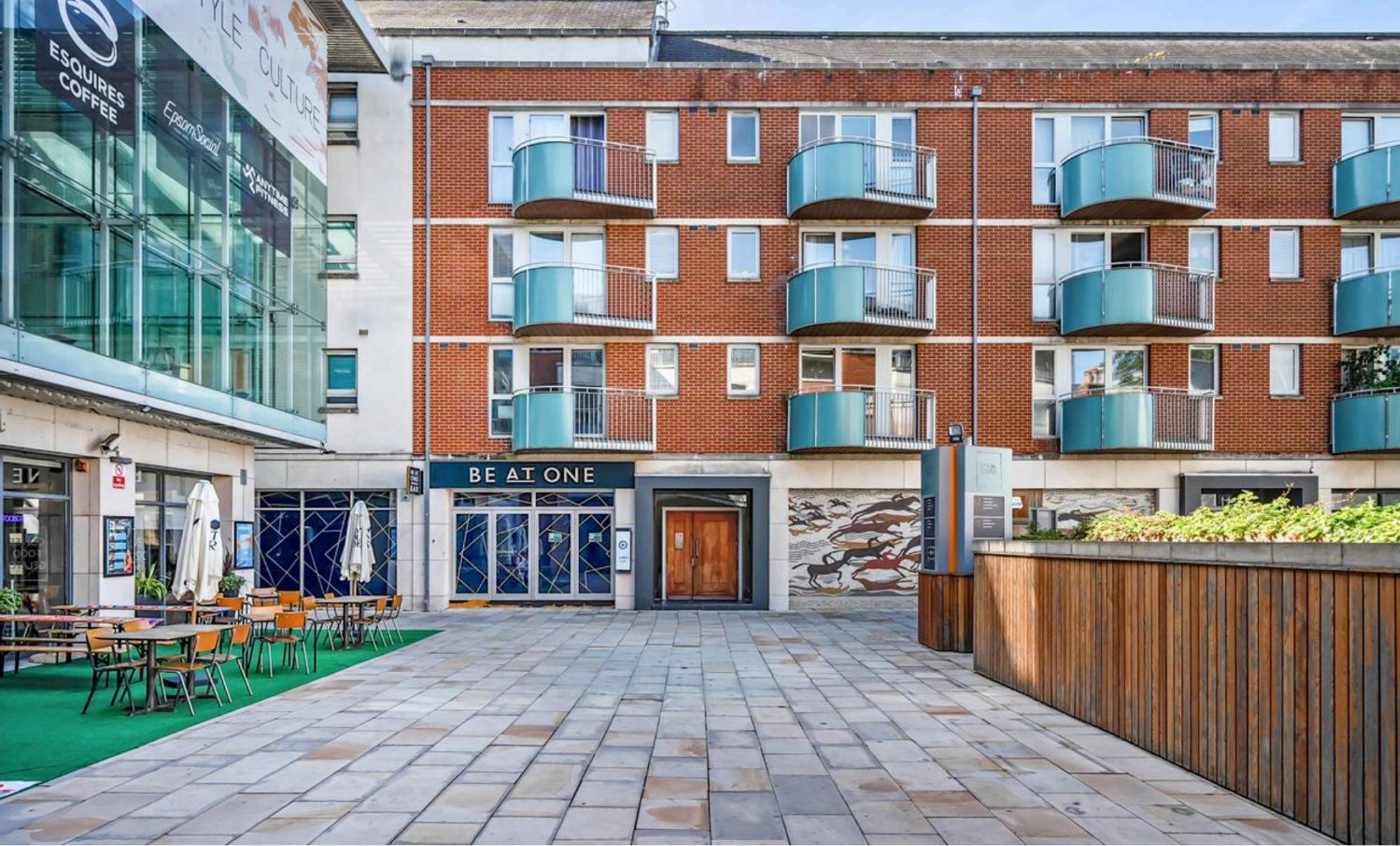
The Oaks Square, Epsom