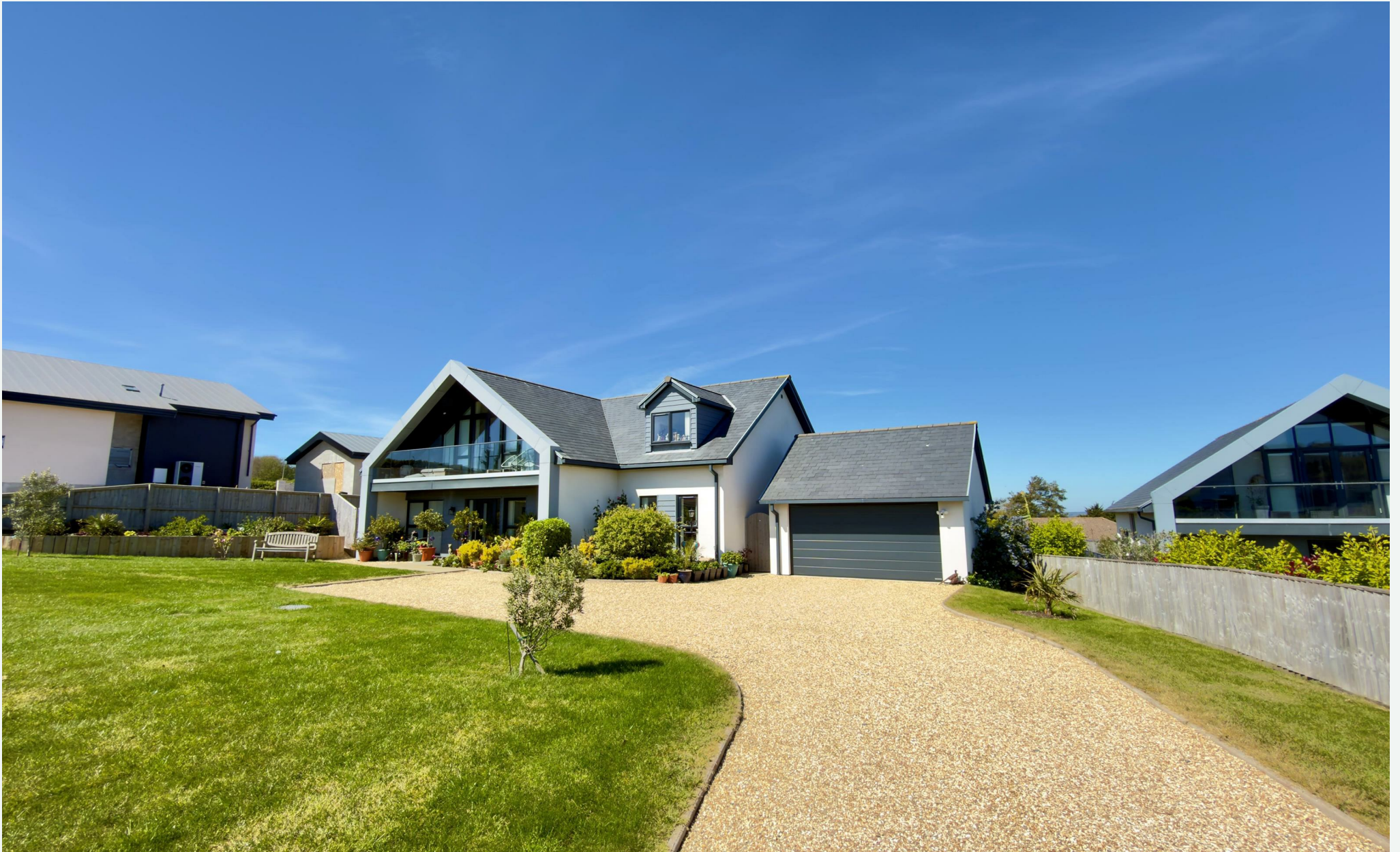
Adeline Alum Bay New Road, Totland Bay, Isle of Wight, PO39 0ES