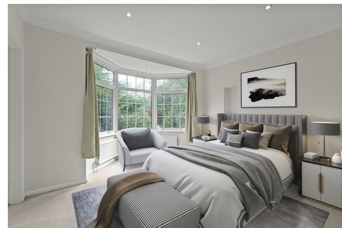
GUIDE PRICE £1,350,000 FREEHOLD