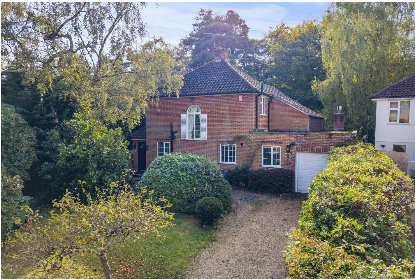
WOODLANDS CLOSE SOUTH ASCOT, SL5 9HU