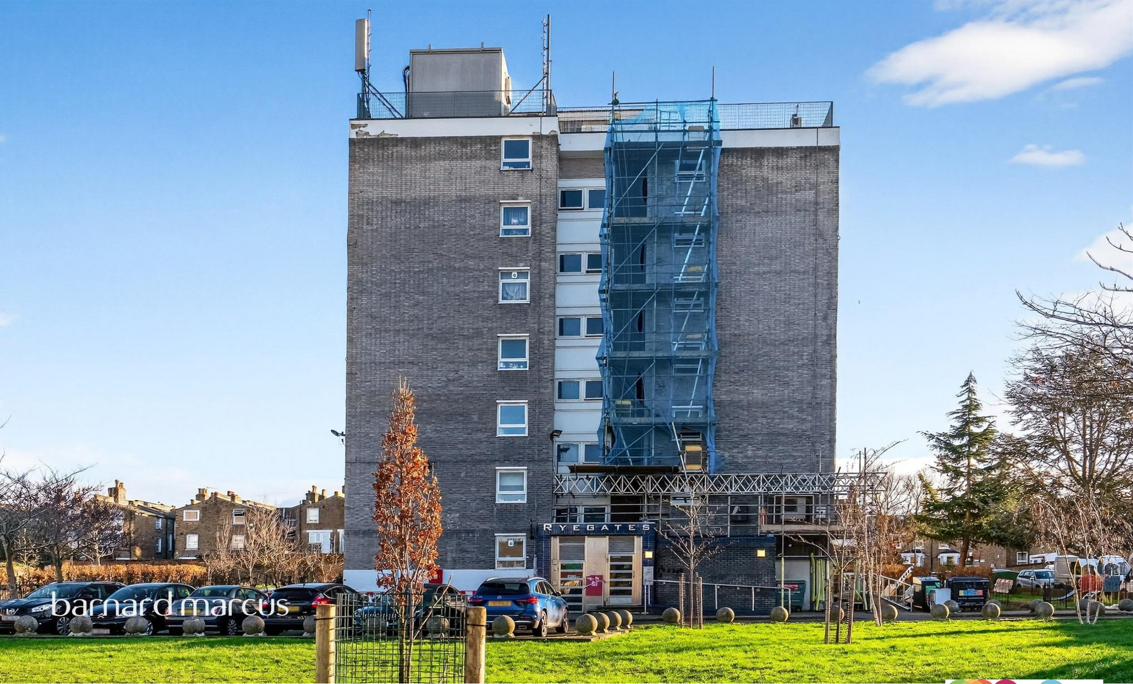
Ryegates Brayards Road Estate, London SE15 2DF