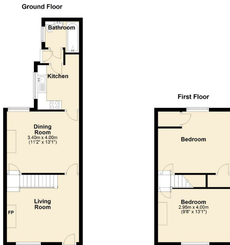
2 BOYD STREET, Maryport